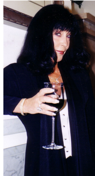
Shoshana Barer in a rarely seen pose.